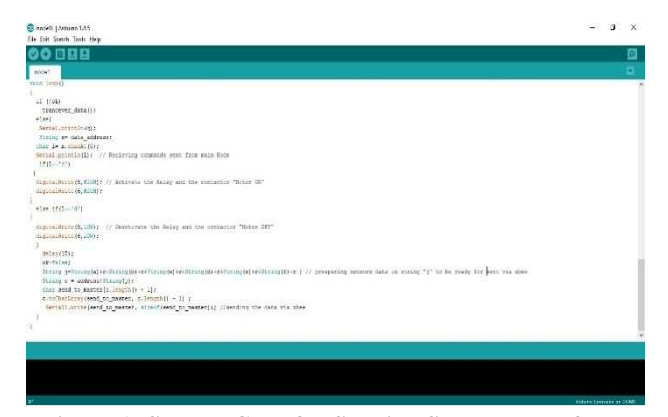
Figure 1: Sample Code for Sending Sensors Data from Node 1 to the Main Node.

Every revolution generates Interrupt, we used interrupt number 4 configured to start in every falling edge of pin D7 input of Arduino Leonardo board "means in every change of input state from logic 1 to logic 0 of pin D7 the interrupt is starts". We used timer for calculating the amount of time between two interrupts "in milliseconds", the resulting number will be transferred to minute. The final presented value will be the average value of 10 readings to get the stable value.